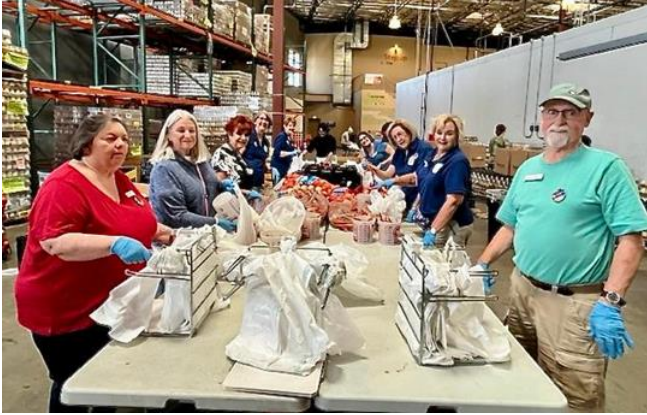
Bagging food at FIND Food Bank

It was a busy, productive, and satisfying two months. That's the best kind.