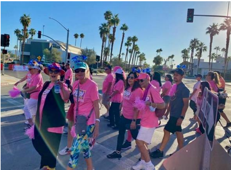
Paint El Paseo Pink Walk to End Cancer