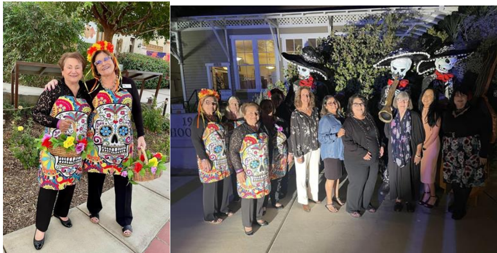
Raffle ticket sellers at CV History Museum's Dia de los Muertos