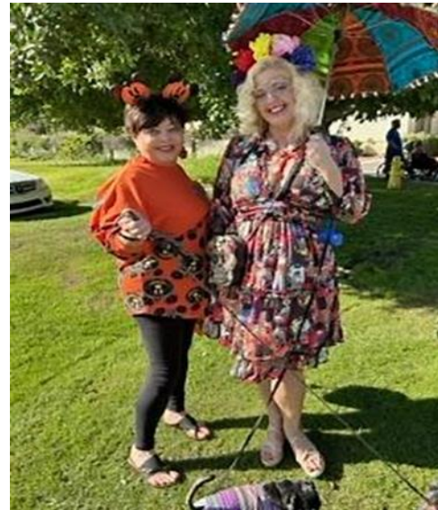
Mother, daughter, and dog at Pet Parade for nursing home