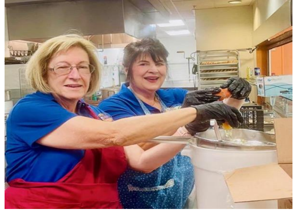
Two more eggs & counting. 800 eggs cracked and stirred at the CV Rescue Mission.