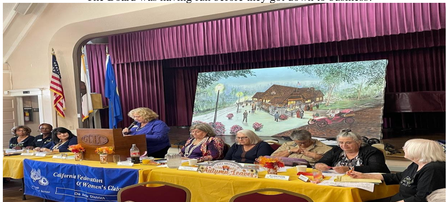
De Anza District Conference – September 18, 2023 – WICC, Corona, CA Down to business