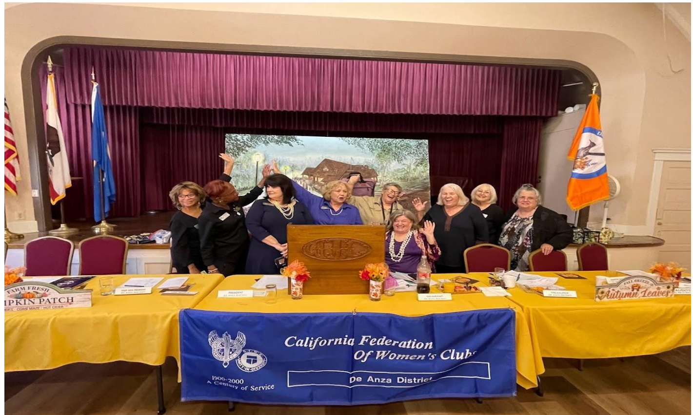
The Board was having fun before they got down to business!